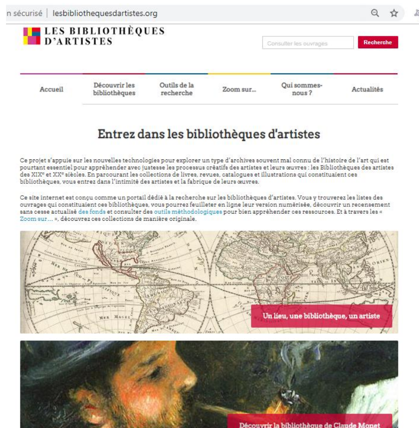
Figure 1. Home page of www.lesbibliothequesdartistes.org