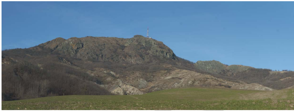
Figure 1. The landscape view of Mt. Prinzerà's eastern side. The ophiolitic rock complex rises from the surrounding gentler slopes made up of soft rocks (clay-rich breccias and flysch). The rock mass is divided into several portions (in the middle/left-hand side of the photograph the principal one and on the right-hand side the secondary blocks) because of the presence of E-W fault system.

and peridotites breccias, with a maximum thickness of about 250 m. Selective erosion has removed the surrounding pelitic soft rocks leaving the ultramafic olistolith emergent in the landscape (Figure 1).