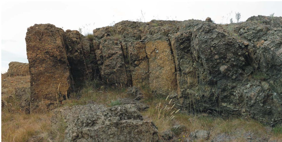
Figure 5. The discontinuities are often pervasive and open, thus the rocks appear completely detensioned, as in the outcrop of peridotites shown (see photograph number 3 on the geomorphological map).

Their shape could indicate that their development was caused by erosive processes which removed surface material from an extensive area rather than by the action of erosion acting in a well-defined direction (i. e. rill and gully erosion). This might support the hypothesis that the genesis of these surfaces was driven by planar structural or tectonic features.