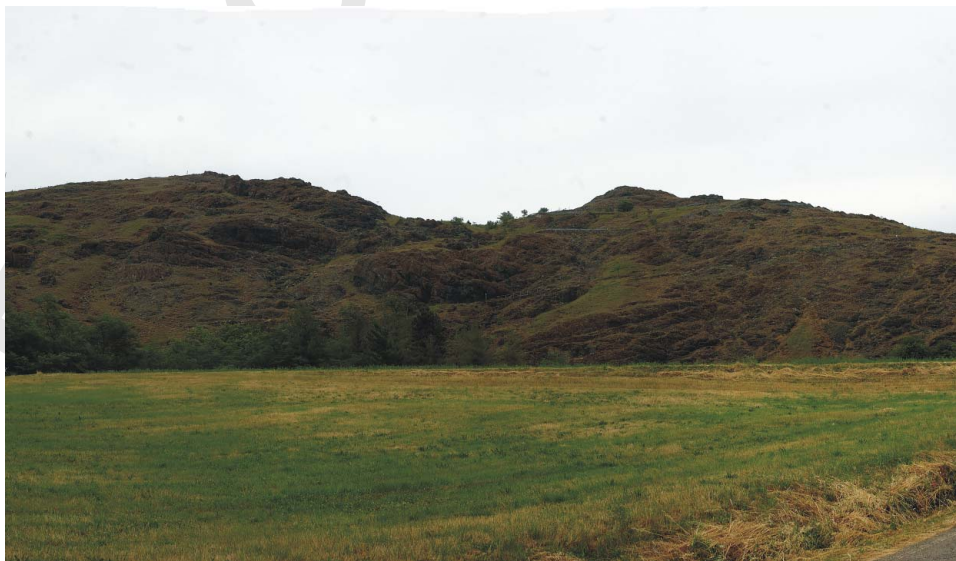
Figure 4. The gap shown in the picture, corresponding with Mt. Prinzerà's southern sector, is one of the better developed in the study area. These landforms are often aligned with linear forms, such as gullies and rills.

of control exerted on the erosion of running water. The development of parallel gullies and rills on Mt. Prinzerà's western side is worth noting as it is emphasized by the presence of scarps parallel to the previous features.