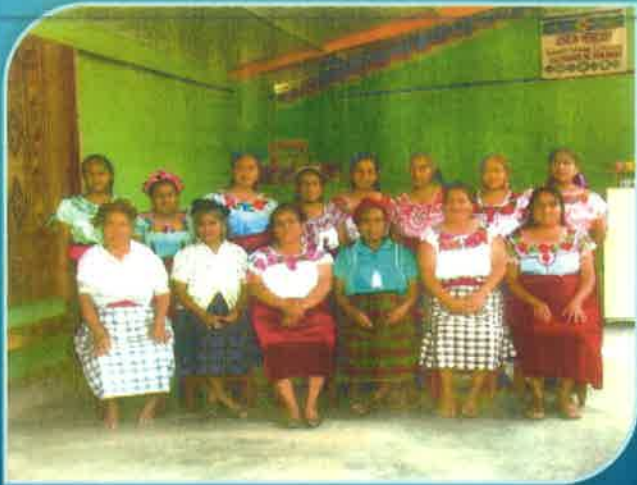
Vida Nueve Women's Cooperative