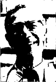
Dr. Robert M. Solow Institute Professor and Professor of Economics Massachusetts Institute of Technology Recipient of the 1987 Nobel Prize in Economics

A Nobel prize—rather like James Bond’s 007—appears to be a license to have an opinion about anything. But economics was founded by Adam Smith on the rock of the Division of Labor, and specialization is the name of the game. So I am going to specialize on the state of macroeconomics, mostly theoretical but with a few glances at applications. Distinguished and clever economists have been heard to remark knowingly that they understand microeconomics perfectly well and know what they think about this or that, but do not understand macroeconomics at all and find it a mystery. I have no patience with that ploy. Macroeconomics is what it is all about. If you do not understand the business cycle, unemployment, inflation, the real exchange rate, well, you do not understand economics at all. Microeconomics is easier, of course; it does not set itself such hard problems or aim at passing such hard tests.