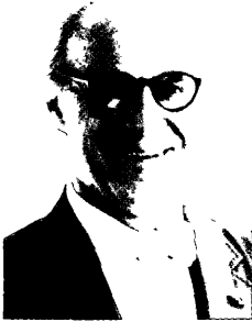
Dr. Lawrence R. Klein Benjamin Franklin Professor of Economics and Finance University of Pennsylvania Recipient of the 1980 Nobel Prize in Economics