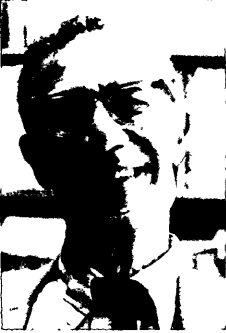
Dr. Robert M. Solow Institute Professor and Professor of Economics Massachusetts Institute of Technology Recipient of the 1987 Nobel Prize in Economics

A Nobel prize—rather like James Bond’s 007—appears to be a license to have an opinion about anything. But economics was founded by Adam Smith on the rock of the Division of Labor, and specialization is the name of the game. So I am going to specialize on the state of macroeconomics, mostly theoretical but with a few glances at applications. Distinguished and clever economists have been heard to remark knowingly that they understand microeconomics perfectly well and know what they think about this or that, but do not understand macroeconomics at all and find it a mystery. I have no patience with that ploy. Macroeconomics is what it is all about. If you do not understand the business cycle, unemployment, inflation, the real exchange rate, well, you do not understand economics at all. Microeconomics is easier, of course; it does not set itself such hard problems or aim at passing such hard tests.