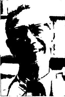
Dr. Robert M. Solow Institute Professor and Professor of Economics Massachusetts Institute of Technology Recipient of the 1987 Nobel Prize in Economics

A Nobel prize—rather like James Bond’s 007—appears to be a license to have an opinion about anything. But economics was founded by Adam Smith on the rock of the Division of Labor, and specialization is the name of the game. So I am going to specialize on the state of macroeconomics, mostly theoretical but with a few glances at applications. Distinguished and clever economists have been heard to remark knowingly that they understand microeconomics perfectly well and know what they think about this or that, but do not understand macroeconomics at all and find it a mystery. I have no patience with that ploy. Macroeconomics is what it is all about. If you do not understand the business cycle, unemployment, inflation, the real exchange rate, well, you do not understand economics at all. Microeconomics is easier, of course; it does not set itself such hard problems or aim at passing such hard tests.