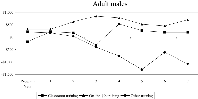
Figure 3.1 Long-Term, Per-Enrollee JTPA Earnings Impacts for Adult Males and Females, by Recommended Service Strategy