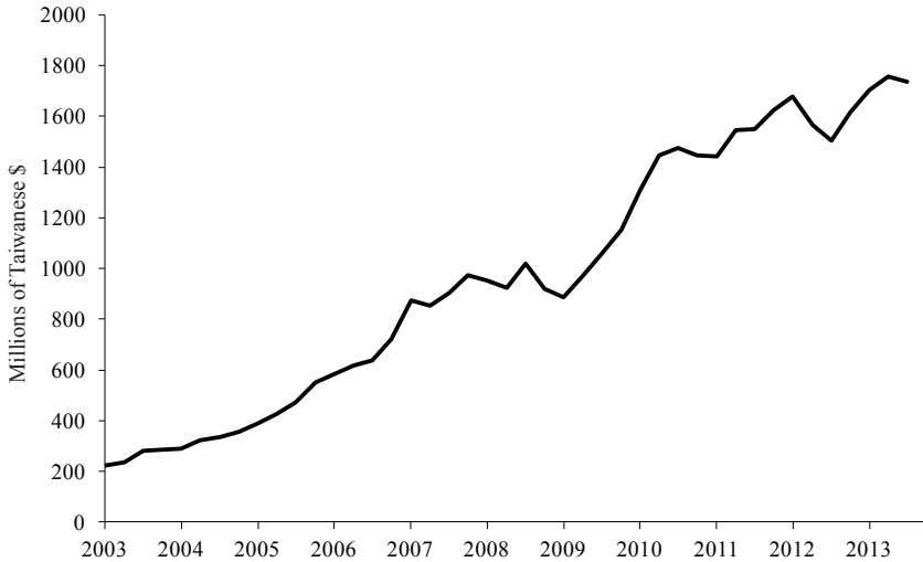
Figure 4.1 Sales of Selected Taiwanese Contract Electronics Manufacturers

SOURCE: Authors’ calculations based on public financial reports. Companies included are contract electronics firms traded on the Taiwan Stock Exchange: Hon Hai (Foxconn), Quanta, Compal, HTC, Inventec, WNC, and ASUS.