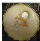
Fig.1. Winter melon Phantom

A cylindrical slice of winter melon was cut from the whole vegetable and a cavity of 4.5 cm diameter was made as shown in Fig. 1.