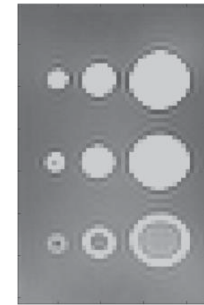
Figure 1: Phantom geometry (MR magnitude).

A custom gelatin phantom (10% gelatin, 1% NaCl) was constructed with three rows of circular wells with increasing diameters (5, 10, 15mm). Each series of wells was filled with saline solutions with increasing conductivities (~3, 5, 8 S/m). Cupric sulphate was added for MR contrast (Figure 1). Data was acquired on a Philips Achieva 3T platform, with a standard 3D SE sequence; phase images were used for reconstructing the conductivity. Two-dimensional reconstructions of the electric conductivity based on our inverse approach are presented in Figure 2.