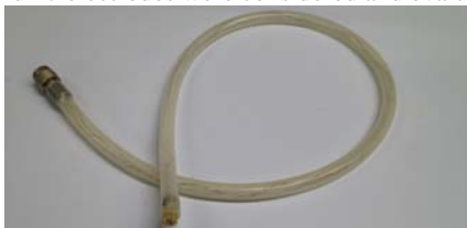
Figure 1: Image of a prototype probe.

Surgical constraints limit the maximum probe diameter to 12 mm (to enable the probe to fit within a laparoscopic port). This defines the design space used for evaluating the number and orientation of probe electrodes. Specifically, the probe was designed to fit as many electrodes as possible within a circular pattern to ensure 1) maximum coverage of the probe tip's active surface and 2) a uniform angular sensitivity. One mm diameter electrodes arranged in circular pattern were therefore chosen for the design. Based on the constraints, three cylindrical probes with 8, 9, and 17 electrodes were considered and evaluated.