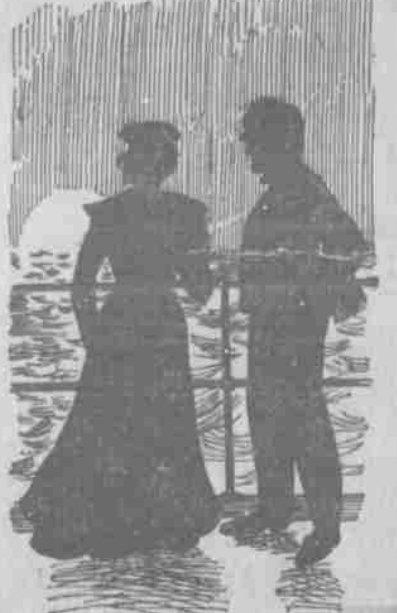
PUG DOG REPLACES "DA MONK."

course, I wouldn't say it publicly, but I have always thought that there was a good deal more of the savage in a woman than in the man. Look how she admires the bloodiest kinds of deeds, so they be bravely done.