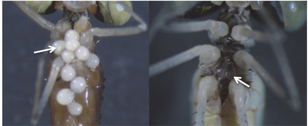
Fig 1. Comparison between live and resisted Arrenurus water mites, left image represents engorged live water mites on a Nehalennia irene individual, the right picture represents resisted dead water mites on a Nehalennia gracilis individual.