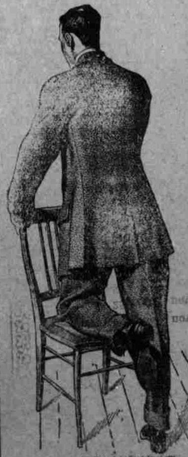
Copyright 1909 by Hart Schaffner & Marx