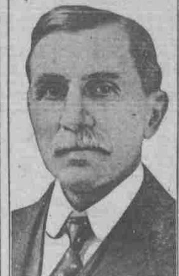
HARVEY B. FERGUSSON.

He was the first congressmen from New Mexico following admission of the state in 1911, and was re-elected