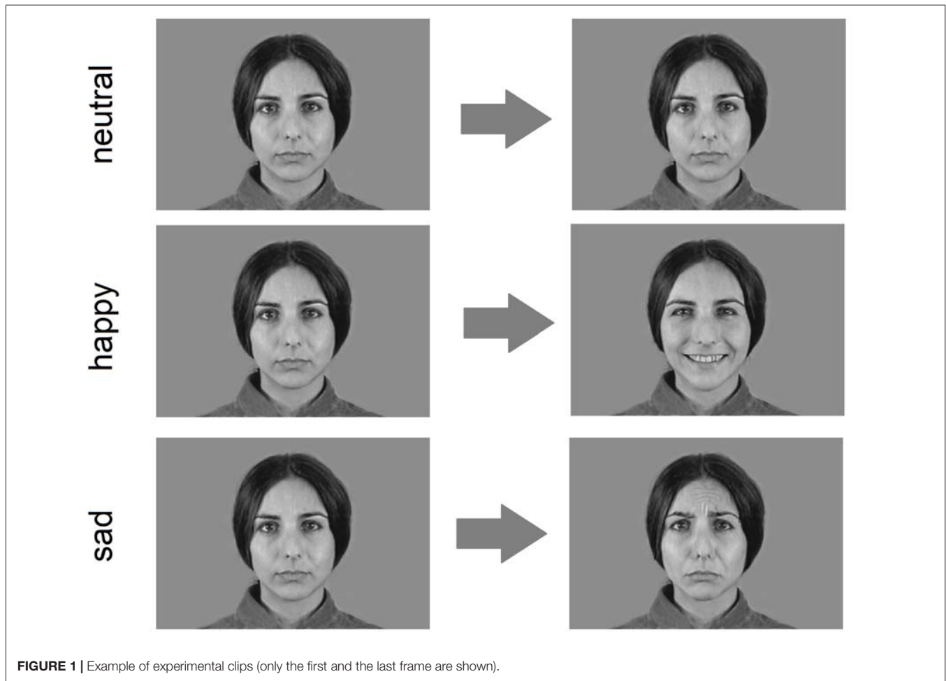
FIGURE 1 | Example of experimental clips (only the first and the last frame are shown).

expressed as percentage of maximal contraction rather than as absolute values. (2) Continuous EMG recordings were parsed into trials by considering the window from -800 ms to +2800 ms from stimulus onset. (3) Data were averaged in 400 ms consecutive bins, thus obtaining nine consecutive values of EMG for each trial. (4) The two pre-stimulus bins were averaged to create a baseline EMG value. (5) The seven post-stimulus bins were baseline-corrected by subtracting from them the baseline values. In the resulting data, any positive value indicated increased EMG activity compared to baseline and negative values indicated decreased EMG activity compared to baseline. (6) EMG data from each bin were averaged within subjects according to the emotion displayed. The resulting dataset included for each subject a total of six ( 2 muscles \times 2 sides \times 3 emotions) series of seven bins each.