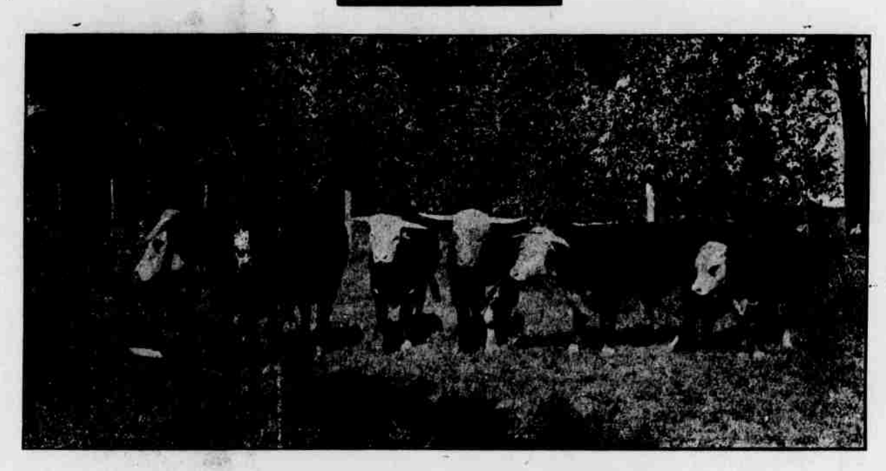
HIGH GRADE HEREFORDS ON RANCH NEAR ROSWELL.