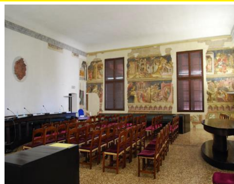
Aula Guariento