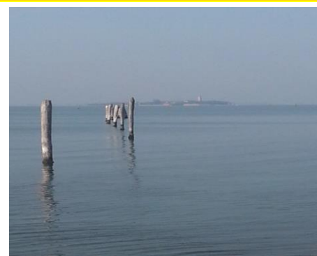
La laguna di Venezia, Ospedale San Camillo