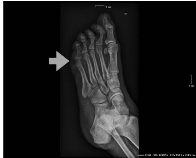
Figure 1 Osteomyelitis of the head of fifth metatarsus in the left foot.

A 67-year-old white male patient with type 2 diabetes was admitted to our department for fever, lower back pain, and severe infected ulcers in the left foot as shown in Fig. 1. In addition to diabetes, his medical history included the following: hypertension, chronic kidney disease, peripheral arteriopathy, dyslipidemia, and a previous history of vertebral osteomyelitis. The diabetic foot ulcers appeared since 1 month, and had been treated, in the first instance, with a conservative approach by dressings with topical antiseptic and oral antibiotic therapy such as amoxicillin, according to Staphylococcus aureus methicillin-sensitive isolated by bone biopsy performed in an ambulatory setting. Nevertheless, the infection further progressed involving the deep layers of the foot, also causing systemic symptoms. On admission, the patient's body temperature was 38°C and his left foot was malodorous, hot, erythematous, and edematous up to the level of the