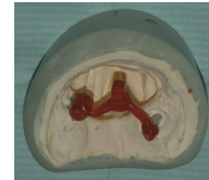
FIGURE 6. A multiunit resin jig was created connecting the 3 implants.

the right side and 1 contralaterally (all of them 35-mm long), were inserted. Six months after implant placement, the abutment was installed (Fig. 5). No mucogingival grafts were necessary.