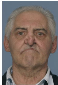
FIGURE 2. Preoperative frontal view of the patient: a deep retracting scar is evident in the nasolabial fold, while the left side of the nasal pyramid appears to be deeply depressed due to the absence of any skeletal support.

retracted and asymmetrical, while an opening was present between the left nostril and the endonasal cavity (Fig. 3). Radiographic examination revealed a minimal remaining of bone. Owing to the severe periodontal disease affecting the upper second molar, the patient was no longer able to wear the obturator prosthesis that was unstable. Despite the aesthetical appearance which was not satisfactory, the patient just complained about the important functional limitation that had a severe impact to his social and family relationships.