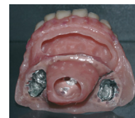
FIGURE 9. The final upper side of the denture: the prosthesis has a central blob for the palatal opening, while in the anterior profile of the arch a second linear blob has been designed to provide support to the nasolabial region.