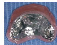
FIGURE 8. The framework inside the denture permits an optimal discharge of the masticatory and loading forces through the prosthesis and the implants axis.