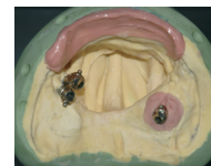
FIGURE 7. Noble metal abutments with secondary male attachments.

Wax-up was performed and phonetic tests made for checking occlusal vertical dimension. Three custom-made noble metal alloy (Skel 80; Fraccari, Verona, Italy) abutments (Gold adapt engaging Branemark system RP; NobelBiocare) were positioned and the overdenture metal framework (Cr_CO Master C 98; Fraccari) modified in order to allow secondary attachments settling (Ot.Cap strategy 154 PCS; Rhein83, New Rochelle, NY, USA): male on the abutment