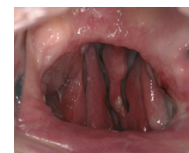
FIGURE 1. Preoperative intraoral view: a wide defect interests the whole hard and soft palate, causing a large opening that directly connects the oral cavity to the nasal fosse bilaterally.

At the time of the first visit, the resection site appeared to be entirely covered by respiratory mucosa. Only the left upper second molar and the tuberosities were preserved. The defect was extended from the hard palate to the soft palate, causing an opening to the nasal cavity bilaterally (Fig. 1). Extraoral examination revealed a severe loss of upper lip support and left maxillary facial depression with a severe loss of nasal base support (Fig. 2). The nose appeared