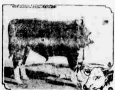
THE POPULAR HEREFORD.

is nothing if not practical. An U as cross of the demandtration of this was had by the promorers of the National Wistern Stock can war and it. Ja an A. Show at Densor Six years ago this drew heavily upshow was started by a number of of the country shot