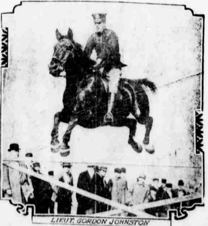
A Cavalry Jumper at the Denver Horse Show, Jan. 16-21. markable Photo Taken at Practice