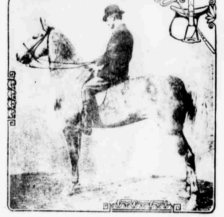
The Popular American Saddie Hurse, at the National Horse Show, Den ver, Jan. 16-21

Currentness intended for winter through should not be allowed to flower limits of the total as such its they meno