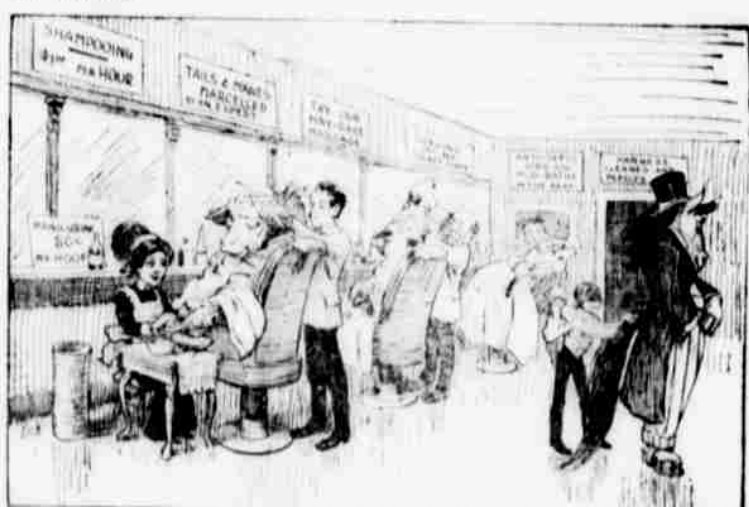
Preparing for the Denver Stock Show, Jan. 16-21.