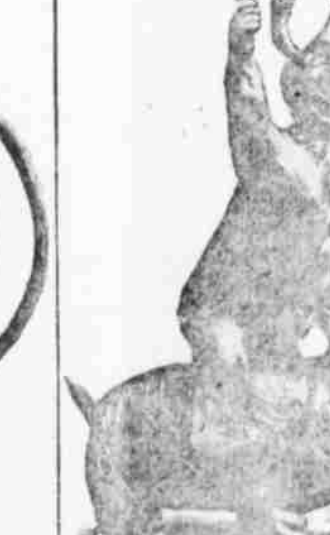
Then mounted upon the Hippo's back, They race quite madly around the track.