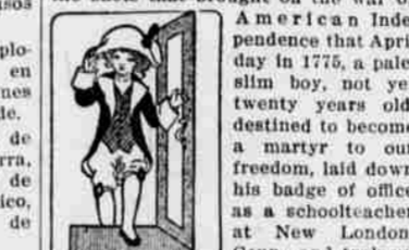
boy was Nathan Hale. His heroic sacrifice to his country's cause is one of the treasured pages in American history.

The Carbonate lease on Mount Baldy has a couple of carloads of heavy lead ore ready to ship.