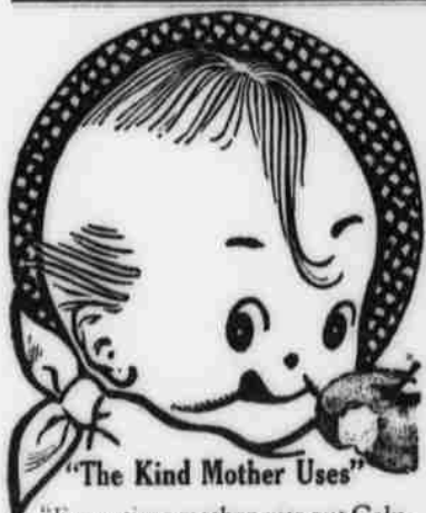
"The Kind Mother Uses"