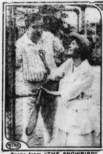
Scene from "THE SNOWBIRD"

Matinee prices 5 & 15 cents. Evening 10 & 15 cents.