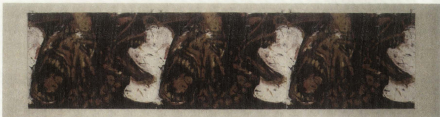
Figure 2. Déjà vu #1 , 2017, Mixed printmaking techniques, 60 x 20 in. In collaboration with Josh Orsburn.