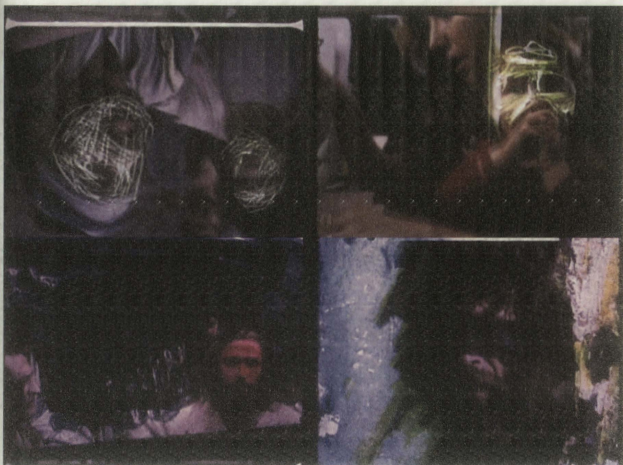
Figure 4. Stills from Persistence of Vision , 2017, made out of 8 mm found footages from Albuquerque Basement Films, 1 min and 29 secs.

Assemblage is the matter in these days as it has mattered in the past both artistically and politically. Art practices, just like individual struggles, will never be accomplished unless they assemble themselves with other contemporary artistic/political struggles as well as with their historical paraphrased struggles. The assemblage happens in a now-time, or vice-versa, otherwise now-time without assemblage, without synthesis, would lose its meaning. I believe in order to exist in the now-time we even need not necessarily create new images but we can just assemble of what we already have. Maybe now is the time to loot the museum storages, archives, footages, and negatives. These heaps of ash, heaps of history, or trash fields of so-called human intellectual achievements, are to be re-assembled by individual or collective struggles. Let us bring the now-time into the art world that is detained between the past and the future.