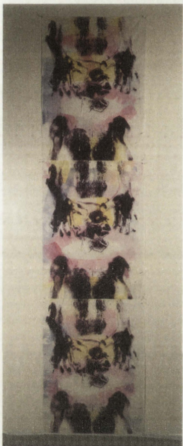
Figure 3. Déjà vu #2 , 2017, Mixed printmaking techniques, 20 x 90 in. In collaboration with Amanda Moris.

My two other pieces here are the result of my examinations on the meaning of institutionalized printmaking, which I developed through a teamwork with two professionally trained printers. Although editions here are individual memories of matrices, they are also memories that are chained/assembled together like historical events. As an artist who believes the same social structures reside in different realms of humanity, it is not a mere coincidence that I make individual images which need the reproduction of themselves side-by-side to maintain themselves. By doing so, I visualize the dimension of time found in the practices of art-making in such manners of reproduction. As we repeat history with the illusion of progress and we realize a certain event has happened before, in each sheet, there are elements that are needed for the next sheet to keep the illusion of the progression of time. This is to say, maybe in order to achieve real progress in our historical assemblage, we need to think about a mode of production that fills the time with now-time.