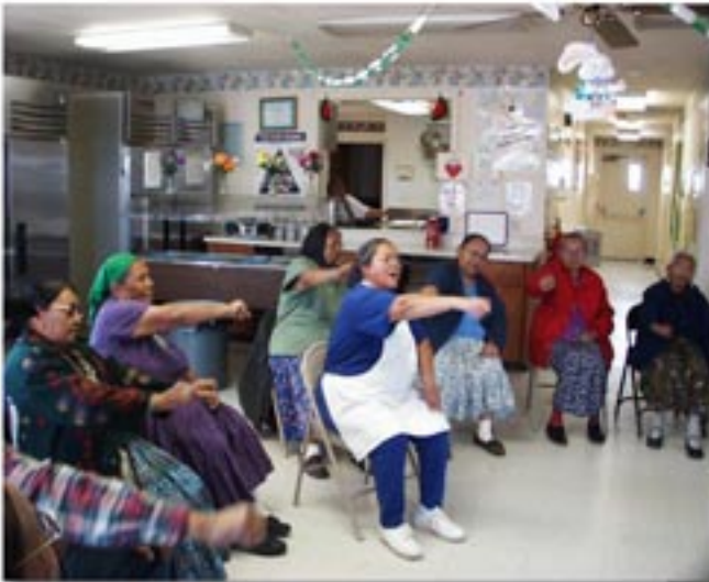
Navajo elders at Baca Senior Center demonstrating Healthy Body Awareness (chair) exercises