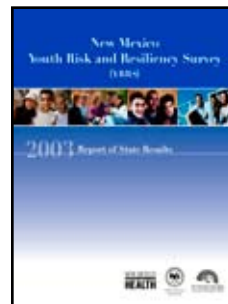
2003 YRRS Report