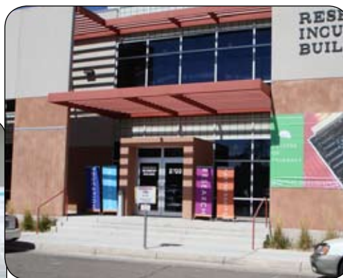
The Research Incubator Building Open House Poster session and reception on September 29, 2006,