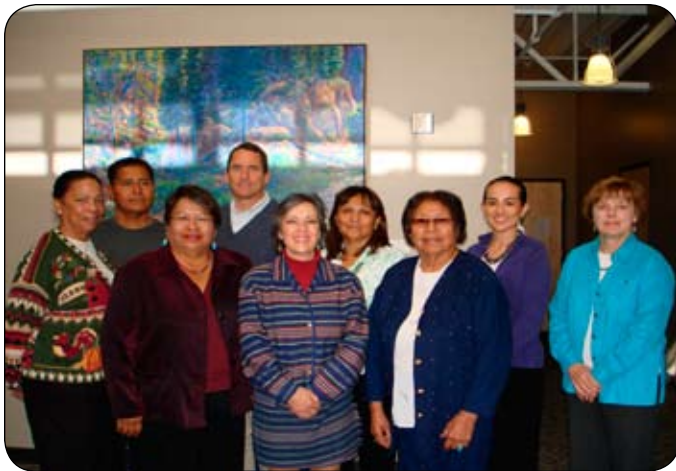
UNM PRC Community Advisory Committee members

The UNM PRC Community Advisory Committee assists the UNM PRC to address the health promotion and disease prevention needs of New Mexican communities through participatory, evidence-based, health promotion and disease prevention research.