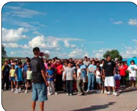
"Your Life's Direction" event at Zuni Intermediate School.

Another important aspect of the program entails data collection. All program services and activities allow us to collect data on participants and track their progress, which will