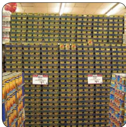
Common scene at Rez grocery stores: a Spam stack.