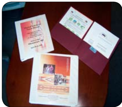
Physical Activity Kit (PAK)

This training showcased the Physical Activity Kit – PAK , research-tested and evidence-based programs for American Indian and Alaska Native communities. The PAK components were divided into three sections based on the Centers for Disease (CDC) guidelines to address age appropriateness through the life span for young people, adults/family, and older adults and include different levels of activity (Strength, Flexibility, Cardio, and Demonstration/Activities).