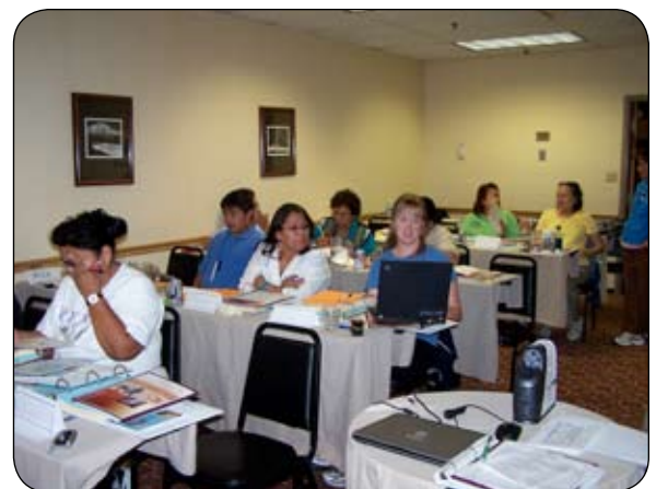
PAK Teams working on Action Plans.