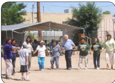
PAK demonstration, Isleta 2007

Approximately 1,500 Native American elders from across New Mexico attended and participated in the day's events that showcased the cross-country bus tour to promote Medicare and prevention efforts. ◆