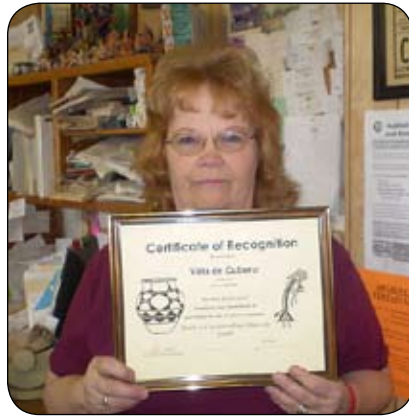
Villa de Cubero merchant

A student who participated in the compliance checks stated, "I liked knowing that the stores ask for ID." Appreciation goes to the following merchants for keeping in