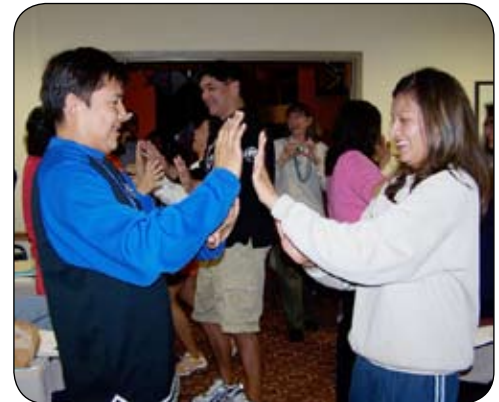
PAK Teams demonstrating Exercise Breaks.

A special thanks to the PAK Field Teams 2007 and our Indian Health Service partners (Health Promotion Disease Prevention, Head Start, Community Health Representatives and Nutrition) pictured above.