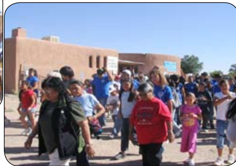
"Just Move It" walk, Isleta 2007