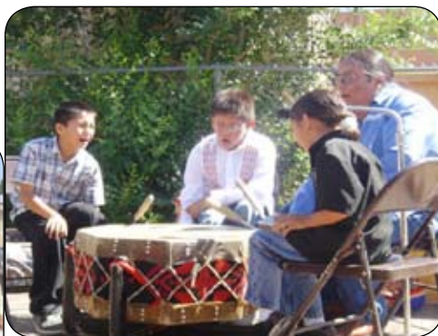
Isleta Drum Group, 2007