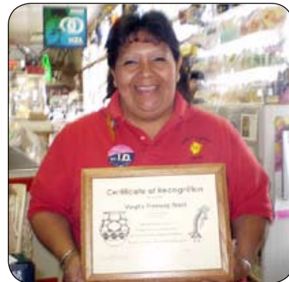
Voigt's Freeway Shell merchant

The Synar project is funded by the New Mexico Department of Health, Office of Substance Abuse Prevention. The ACL Teen Centers have served the ACL communities for over 20 years. They provide medical and mental health services to students from two school-based health clinics at To'hajiilee Community School and Laguna/Acoma Middle/Senior High School. In addition, Substance Abuse Prevention services are provided to students attending the five area elementary and middle schools. The ACL Teen Centers are affiliated with the UNM PRC. ♦