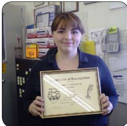
Smith's Center merchant

This spring, four students, ages 14-17, conducted supervised random, unannounced inspections to local merchants. The teens did not carry identification or enough money to buy cigarettes or other products, nor do they disguise themselves or change how they look.