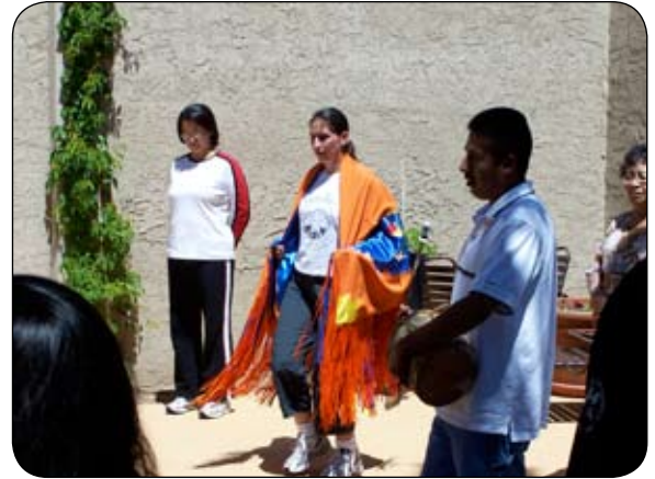
PAK Pow-wow dancing demonstration.

Each Field Site Team developed their own Community Action Plan for the PAK elements they would like to implement in their schools, communities, elderly centers, and youth programs during the next 12 months. On-going technical support and coaching will be provided to the teams through teleconferences and a web-based workstation. At the end of a year the Field Sites Teams will be brought back together at a 2008 PAK Summit in order to share their programs and experiences using PAK in their communities.