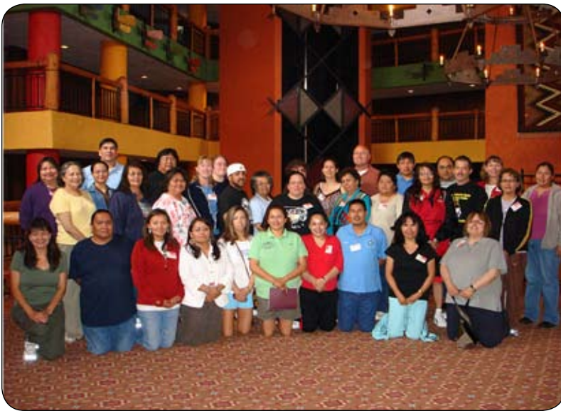
2007 PAK Field Teams, IHS Partners, and PAK trainers.