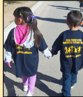
Head Start students at the Pueblo de Jemez on WRTSD

Walk and Roll to School Day (WRTSD) is New Mexico's version of International Walk to School Day. Its purpose is to promote walking and bicycling to school as a way to increase physical activity among students, reduce traffic congestion and air pollution caused by traffic emissions around schools, and raise awareness of the need for routes to school that are safe for non-motorized travel.