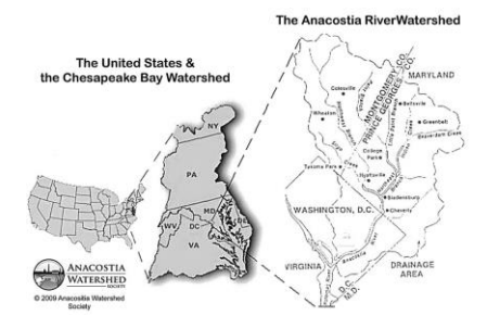
FIGURE 2. Map of the Anacostia River Watershed.

The Anacostia River watershed (or basin)<sup>35</sup> consists of 173 square miles of land in Prince Georges and Montgomery Counties, Maryland, and Washington, D.C., draining into the Anacostia River.<sup>36</sup> See Figure 2.<sup>37</sup> The Anacostia River flows into the Potomac River, which in turn flows into the Chesapeake Bay.<sup>38</sup> Ap-