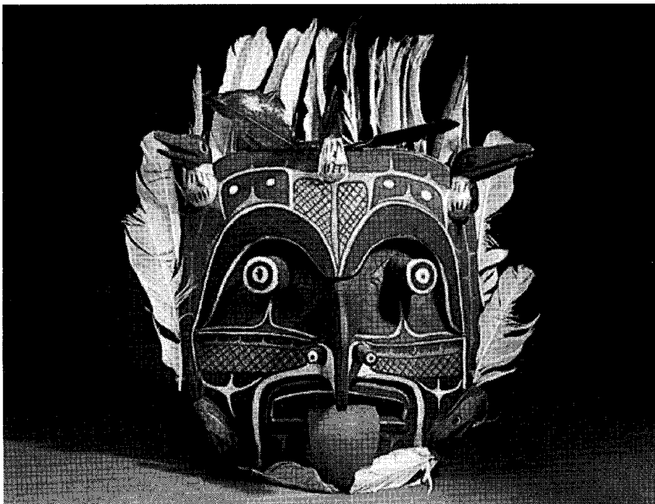
Fig. A: Xwe Xwe Mask

It is important to note that these objects were personal in more ways than ownership. They were created to reflect both the spirit world and the personal features and characteristics of the individual owner, thus serving as an “aesthetic unification between wearer and the being.” Many ceremonial objects had “explicit or implied life cycles” mimicking human life and death. For example, masks (see fig. A), were thought to have transcendental qualities, transforming individual owners into “spirit beings” and the “cosmological state