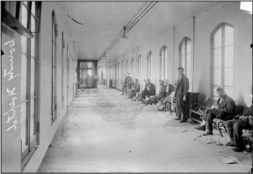
Several men sitting on benches along a hallway in the Cook County Hospital, 1911