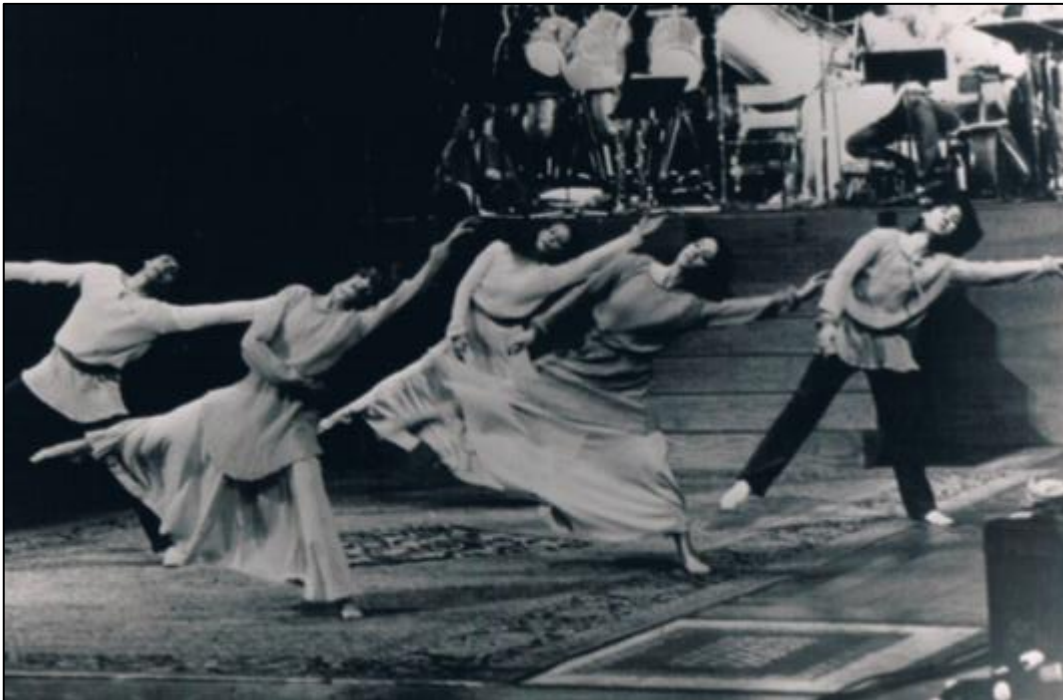
Omega Liturgical Dance Company performing “Canticle to Brother Sun” during the Prelude to the Earth Mass at the Cathedral of St. John the Divine, New York City. The Paul Winter consort is behind the dancers.