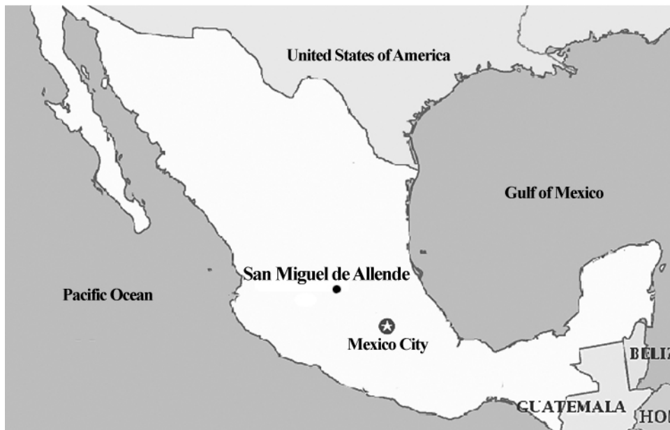
Figure 1. Map of United States and Mexico.

This research study described and analyzed the transnational lifestyle and acculturation experiences of contemporary U.S. expatriate artists moving back and forth between the United States and San Miguel de Allende, Guanajuato, Mexico (Figure 1). This research study presented the perspective of the contemporary U.S. expatriate artists as it examined transnationalism and acculturation challenges and the effect, if any, that this lifestyle had on their creative processes. This work focused on how they craft their art, and how they adapt to the local community, with other U.S. artists, Mexican artists, and other foreign artists living in San Miguel de Allende.