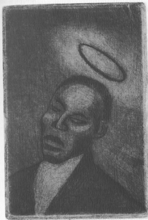
O.J. by Todd Gys '99