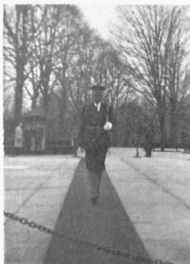
Annapolis cadet guards the Tomb of the Unknown Soldier at Arlington National cemetery (left). Main altar at the National Shrine of the Immaculate Conception (right).