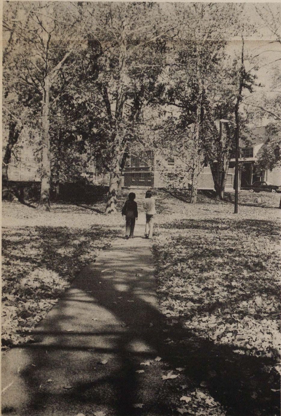
R.I.P.—Indian Summer, November 12, 1975