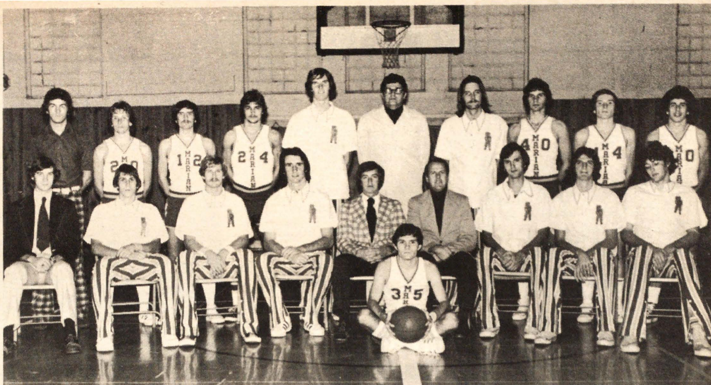
MARIAN KNIGHTS—1975-76 "Bicentennial edition"