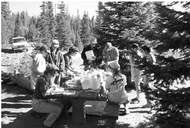
Group Plant Keying Session.

If you are interested in participating in this years Field Studies Project, see announcement for volunteers on page 11.