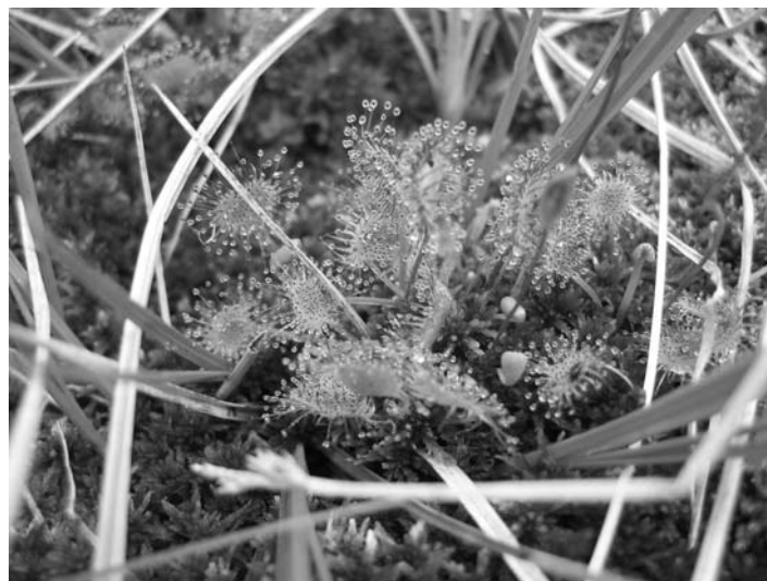
Round Leaved Sundew.

The 25 participants were split into five teams. A total of five sites were visited as a result of this effort, three of which had documented round leaved sundew occurrences, the other two supported similar habitat. Each team was assigned a leader who ensured the following five deliverables were accomplished at each site: 1) confirm sundew occurrences and update