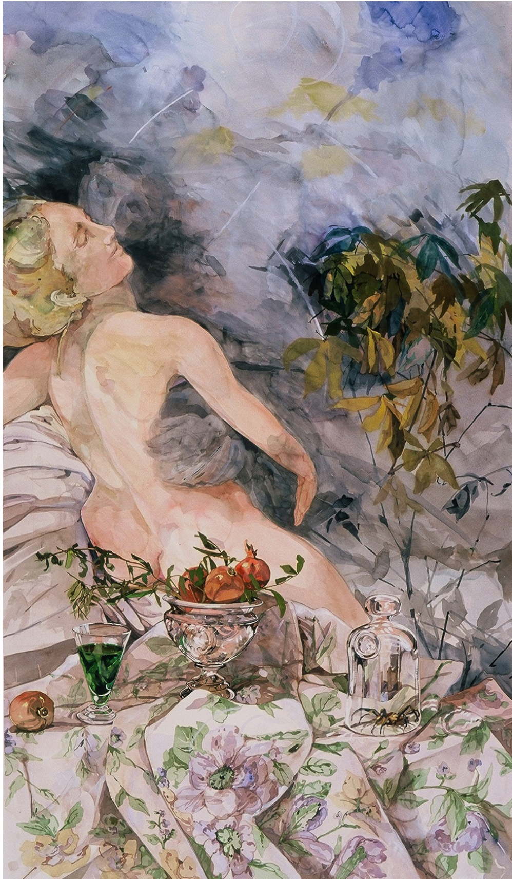
Figure 1. Juno's Revenge, watercolor on paper, 60 in. x 40 in. In conversation with: Antonio Allegri (Corregio), "Jupiter and Io" circa 1520-1540