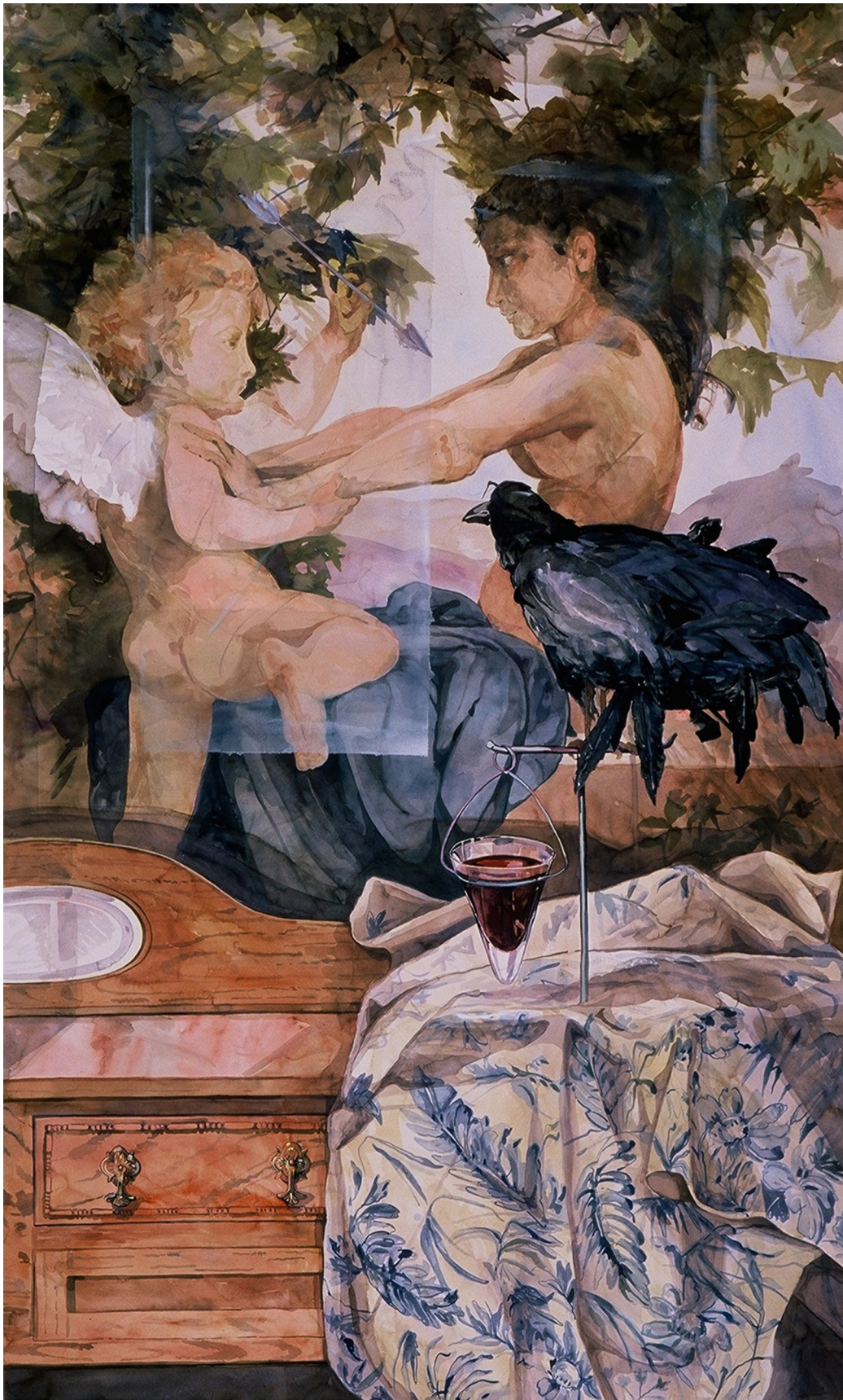
Figure 2. Meyer: Allegory with Onlooker, watercolor on paper, 60 in. x 40 in.

In conversation with: William-Adolphe Bouguereau, "A Young Girl Defending Herself Against Eros" circa 1880