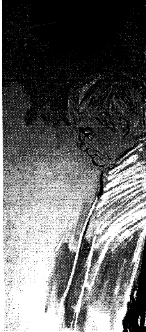
V. V. Nalimov, detail of painting by V. S. Gribkov

I wanted to look through the open window, behind the window of the whole Universe, and that very Universe to grasp.