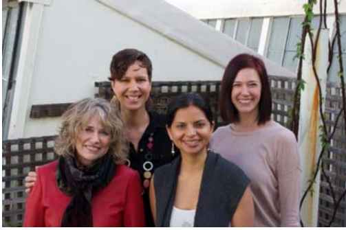
CIIS Integral Counseling Psychology Department