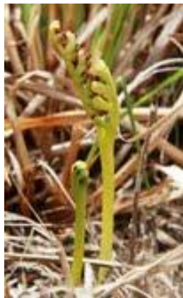
Mature and immature Prairie Moonworts

After not being observed in Colorado since 1997, prairie moonwort ( Botrychium campestre ) was re-located this spring at Bonny Prairie Natural Area. This plant is a member of the Adder's tongue family (Ophioglossaceae), an ancient group of plants distantly related to modern ferns. Moonworts are extremely interesting in that they produce only a single above-ground leaf per year that is divided dichotomously into a sterile, foliaceous part (trophophore) and a fertile, spore-bearing part (sporophore). Most of the plant is below ground, and it does not send up its leaf every year. When a leaf does emerge above ground, it is small and difficult to detect, and is often less than several inches tall. This species of moonwort quickly dies back to the ground after releasing spores, and is only identifiable for perhaps six weeks in the spring.