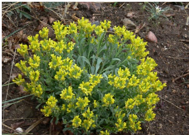
Physarria bellii

you'd like to attend this moderate to strenuous field trip. Space is limited.