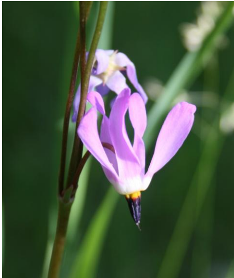
Dodocatheon pulchellum