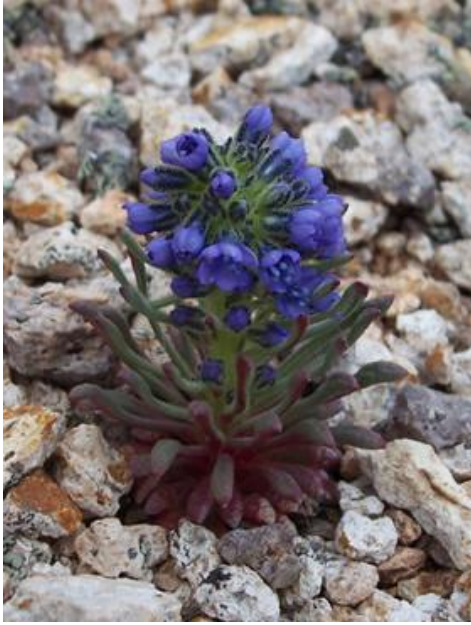
Gilia sedifolia (Luke Tembrock)