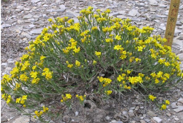
Gutierrezia elegans