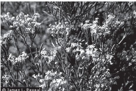
Clay loving wild buckwheat, Eriogonum pelinophilum.