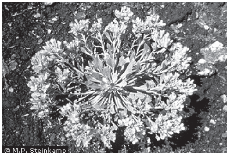
Bell's twinpod, Physaria bellii . Photo courtesy of M.P. Steinkamp @ USDA-NRCS PLANTS Database.

Aquilegia is available via email as an Adobe document. File size is typically 2-3 MB and fast internet connections are needed to download or view it. Send your email address to Eric Lane, eric.lane@ag.state.co.us .