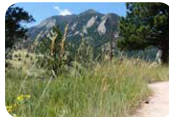
Mesa Trail

During the field trip we will discuss ecological aspects of the very diverse native habitats in the foothills - shortgrass prairie transition as seen along the trail. Topics will include plant community composition, relationships with geology, soils, hydrology, and climate, and the role of key wildlife species.