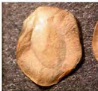
Mentzelia rusbyi seed