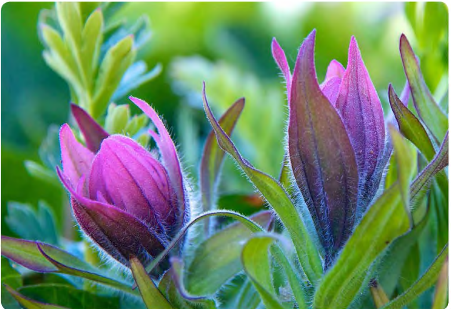
Cover photo: Aquilegia coerulea at Crested Butte, Colorado

See Back Cover for Landscape Category Winner