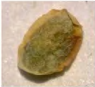
Mentzelia chrysantha seed