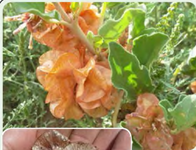
SAND-VERBENA (Smallflower Sandverbena) Tripteroalyx micranthus Family: Four O'Clock (Nyctaginaceae)

Greek koryphe and anthos refer to the location of the flower buds at the crown of the plant. Vivipara comes from Latin and means self-propagating by the production of plantlets. Coryphantha vivipara commonly ranges in the dry prairie montane grasslands and high deserts of the Great Plains from Canada to south of the Mexican border into the Chihuahuan Desert, up to elevations of 8,000 ft or more. This cold-hardy cactus can be successfully grown in a garden desertscape or trough and is available at nurseries. It is considered by some to be threatened.