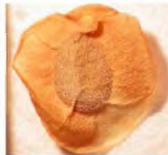
Mentzelia multiflora seed (rough in appearance)