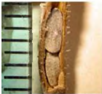
Mentzelia oligosperma seeds in capsule