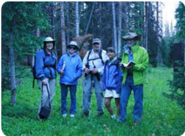
Zimmerman Lake Field Trip

The Northern Chapter is exploring new ground, so to speak: beginning with our initial fall meeting on Thursday, October 3, we will be alternating the meeting location between the Gardens on Spring Creek in Fort Collins (where we have been meeting for some time) and High Plains Environmental Center in Loveland (located in the Centerra development near I-25). So please make sure you check our monthly e-newsletter and/or the website before you come to make sure you are heading to the right location! We will continue to meet on the first Thursday of each month (with some exceptions depending on holidays and such). Please be sure to check the monthly chapter e-newsletter or the CoNPS website ( http://www.conps.org/Chapters/northern.shtml ) for updates and more detailed information before the event. If you would like to be added to the chapter's e-newsletter