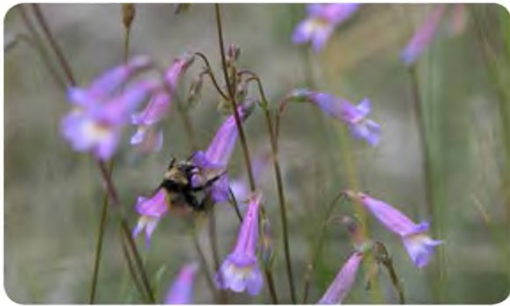
Penstemon griffinii

subtle characters that challenge even veteran botanists. Colorado boasts nearly one-quarter of the 238 North American species. Following an introduction to the morphology and taxonomy of the genus, we will explore the major sections and many of the species represented in Colorado. Samples of many species will be available for close examination by hand lens and dissecting scope. A basic knowledge of plant morphology and descriptive terminology is essential.