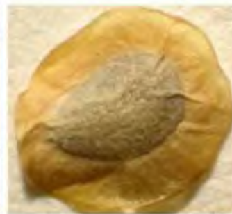
Mentzelia speciosa seed (smooth in appearance)