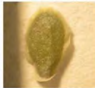
Mentzelia pumila seed