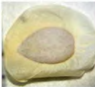
Mentzelia pterasperma seed