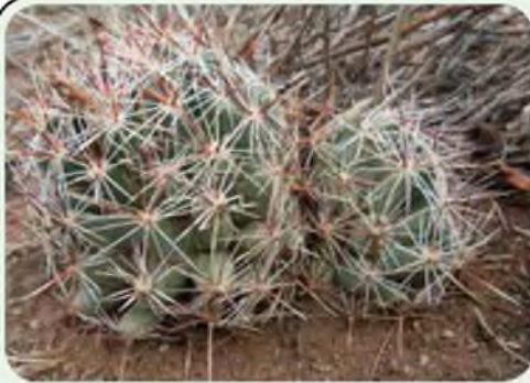
Nipple Cactus Coryphantha vivipara Family: Cactus (Cactaceae)

More often than not, this stout, fleshy inconspicuous plant will be totally overlooked by the casual observer. Its ball-shaped mound is covered with knobby projections called tubercles; each sport 12-16 spines 12 mm. in length (some bi-colored) emanating radially from a