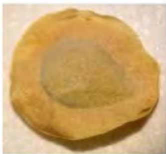
Mentzelia reverchonii seed