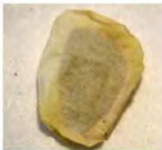
Mentzelia laevicaulis seed