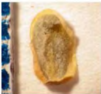
Mentzelia laciniata seed