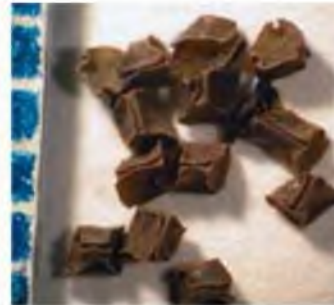
Mentzelia dispersa seeds