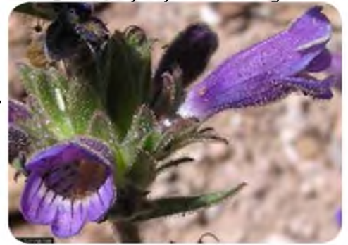
Penstemon breviculus

So we know that Penstemon breviculus lives within eight miles of the entrance to Mesa Verde National Park as do Populus angustifolia/Alnus incana woodlands. We know that Platanthera sparsiflora var. ensifolia ( Platanthera tescamnis ) lives somewhere up in the Thompson Divide as do Abies lasiocarpa/Rubus parviflorus ( Rubacer parviflorum ) forests, but we don't know exactly where they live. And even if we did, the Heritage program is unlikely to know all of the locations where these occurrences are found. It is no accident that so many rare plant and plant community locations are documented near roads and trails. There are lots of places in Colorado where we haven't even looked yet. That is why we need to protect large areas of contiguous ecosystems from any kind of development; and that's why we should step back and do some thoughtful planning about which areas should be left untouched for future generations to enjoy.