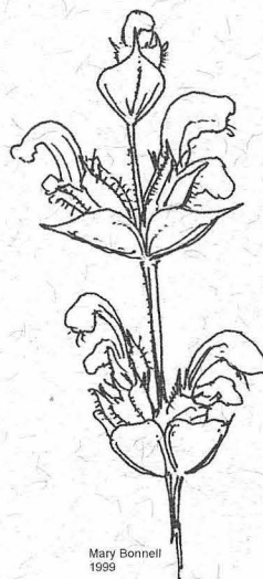
Mediterranean Sage

CBIT (Centre for Biological Information Technology). 2003 onwards. Lucidcentral.com: identification and diagnostic tools ( http://lucidcentral.com ). University of Queensland, Brisbane, Australia.