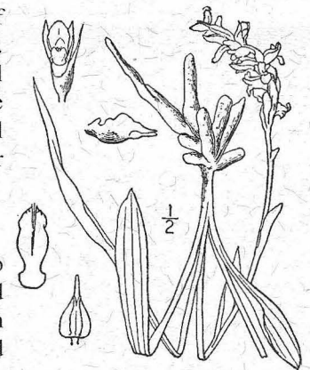
Spiranthes romanzoffiana hooded ladies'-tresses