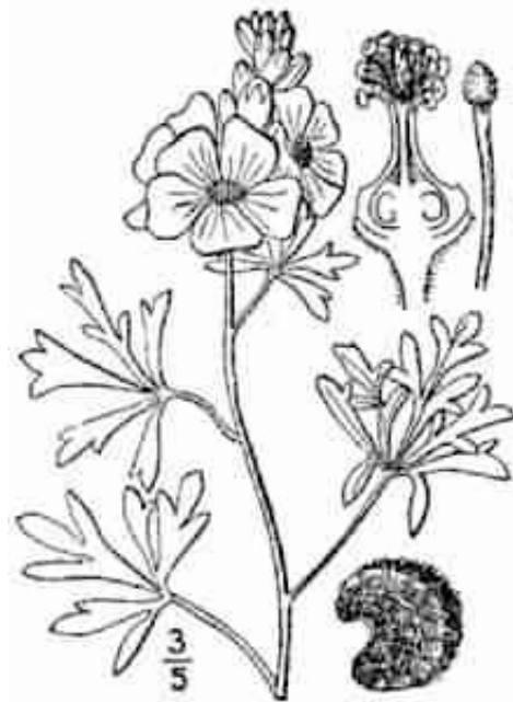
Yerba de la Negrita - Sphaeralcea coccinea Scarlet globemallow

The family requested that donations in her memory be made to CONPS.