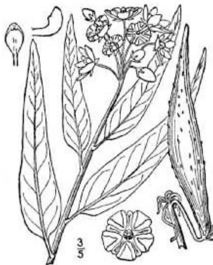
Inmortal - Asclepias asperula Antelope Horn