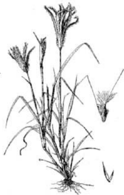
Zacate de cinco dedos - Chloris virgata Five-finger grass

5. Zacate de cinco dedos ( Chloris virgata ), windmill, five-finger feather grass ( Poaceae ). The panicle of this distinctive grass has 6-20 digitate branches in a terminal inflorescence, not only five ( cinco ) as suggested by zacate de cinco dedos (five-finger grass). This plant is dried, ground and sold in boticas as a talisman to protect the bearer from evil. An explanation for this use is a similarity between C. virgata and Chiranthodendron pentadactylon ( Sterculiaceae ). The latter is a medicinal flower from a tree that was highly esteemed by Aztec royalty, a flower that is still for sale in boticas as " flor de manita " (hand flower). This flower has five red stamens that curve outward to resemble a claw (pentadactylon). Knowledge of this famous Aztec plant (with digits) could have inspired someone to collect, name and market five-finger feather grass.