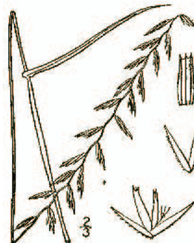
Bouteloua curtipendula (Michx.) Torr. var. curtipendula