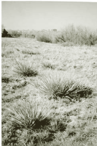
Babi Yar Natural Area, Denver, Colorado

DNAP goals include educating the public to appreciate these hidden gems of nature within the city, and to promote land stewardship by changing the mindset of open land as storage dumps or groomed lawns. Future goals include working with Urban Drainage to naturalize channelization of creeks and restore stream banks. They could use your help as a volunteer or to call or write a letter of support for their efforts to your City Council members and the mayor. Get out and enjoy your sense of place in Denver!