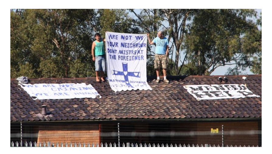
Figure 2. Example of a deep image . Asylum seekers protesting against detention at Villawood Immigration Detention Centre on 22 April 2011.

interrogation because they are created and posted online to perform different roles and fulfil different intentions: to inform, to mislead, to persuade, and/or to sell. Because of these differing roles and intents, these images should not be read at the surface-level. Students need to learn how to unpack these images for their content, context, and purpose in order to fully understand the meaning of the image. Unpacking deep images is important because, if we do not, then it is possible to be misinformed, misled, or otherwise manipulated. Students who use visual literacy and critical thinking skills to determine the intent of images are able to sidestep this manipulation and become discerning citizens.